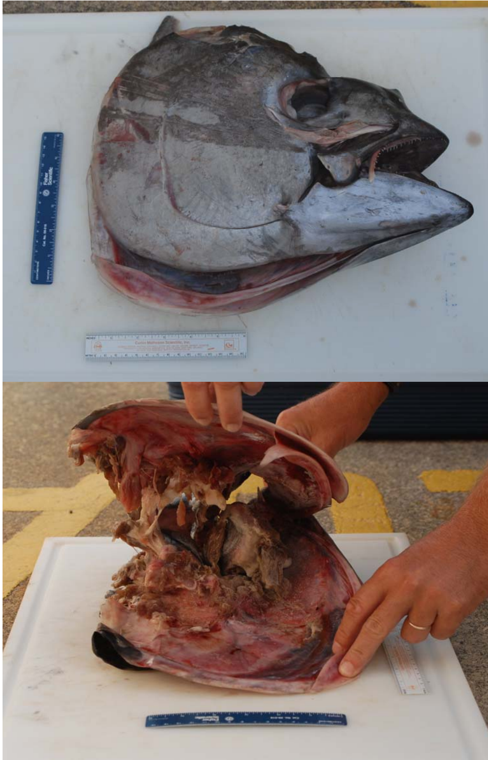
Photographs of tuna heads showing evidence of depredation by pilot whales.